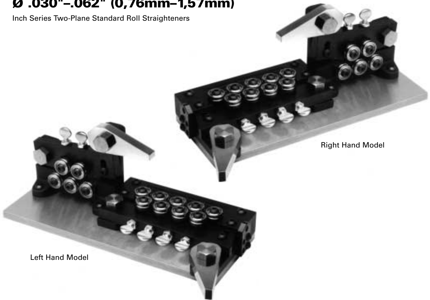
Left Hand Model

Inch Series Two-Plane Standard Roll Straighteners